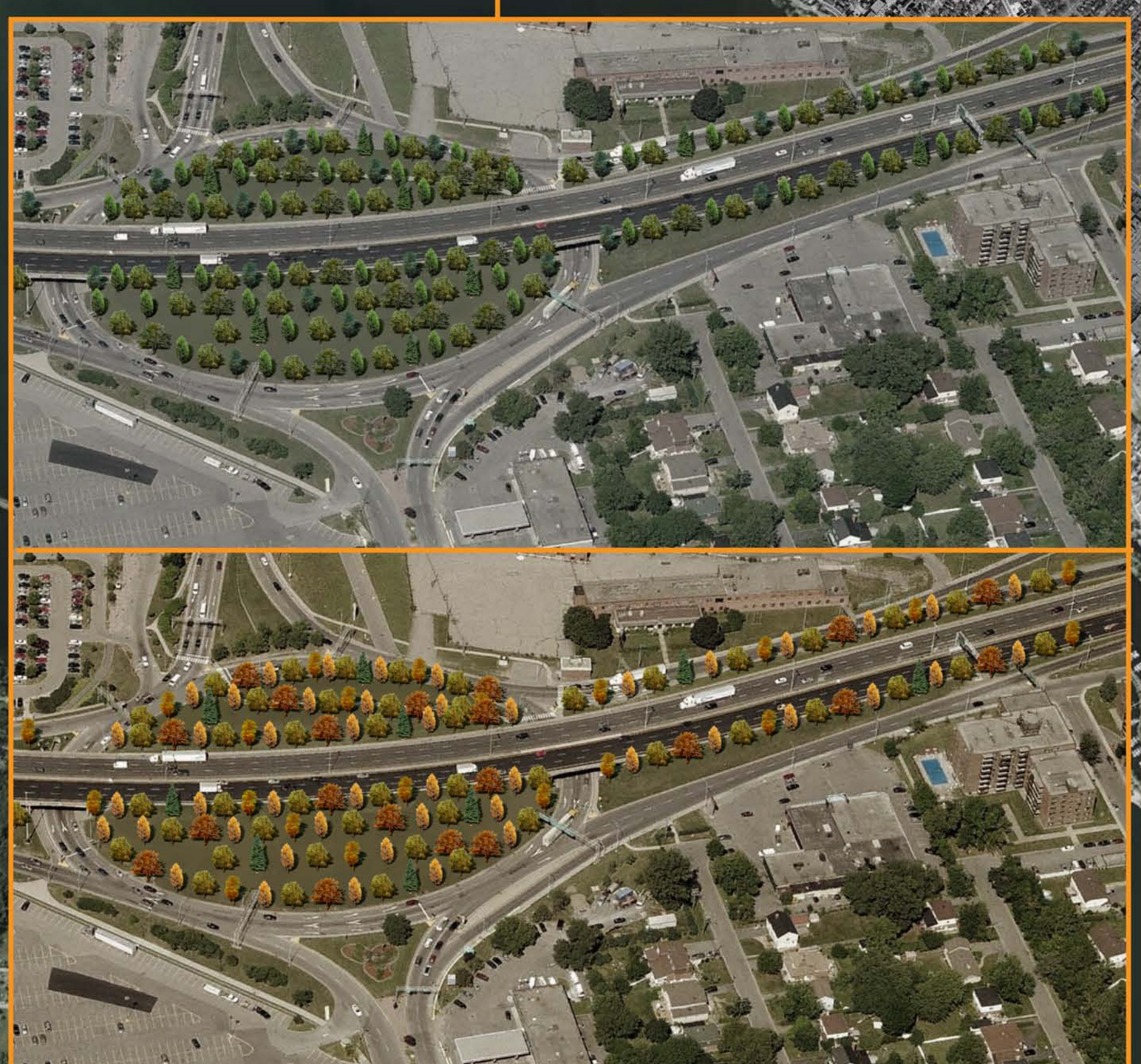
Summer & Autumn at Dorval Interchange