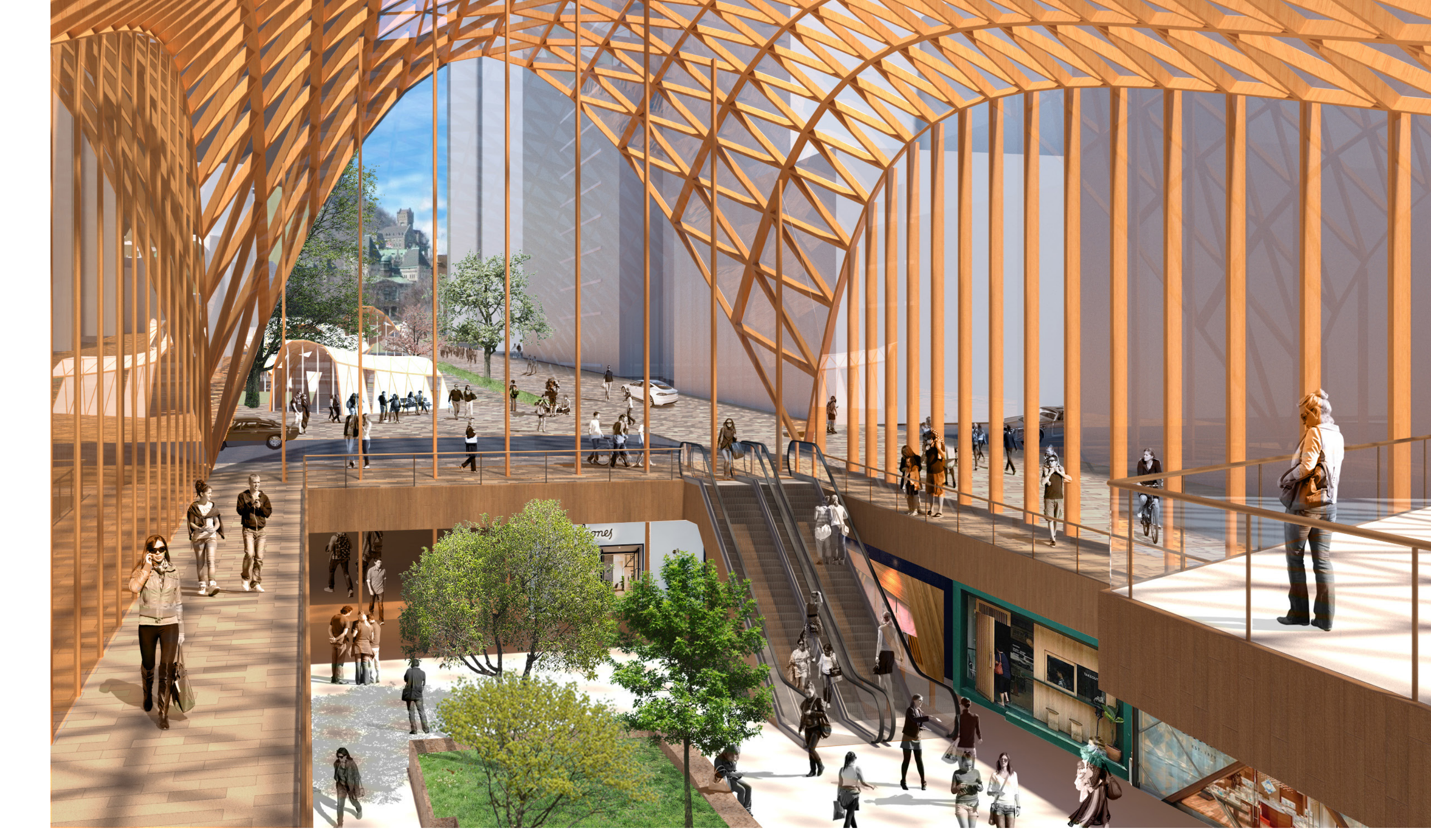
Impression of the atrium