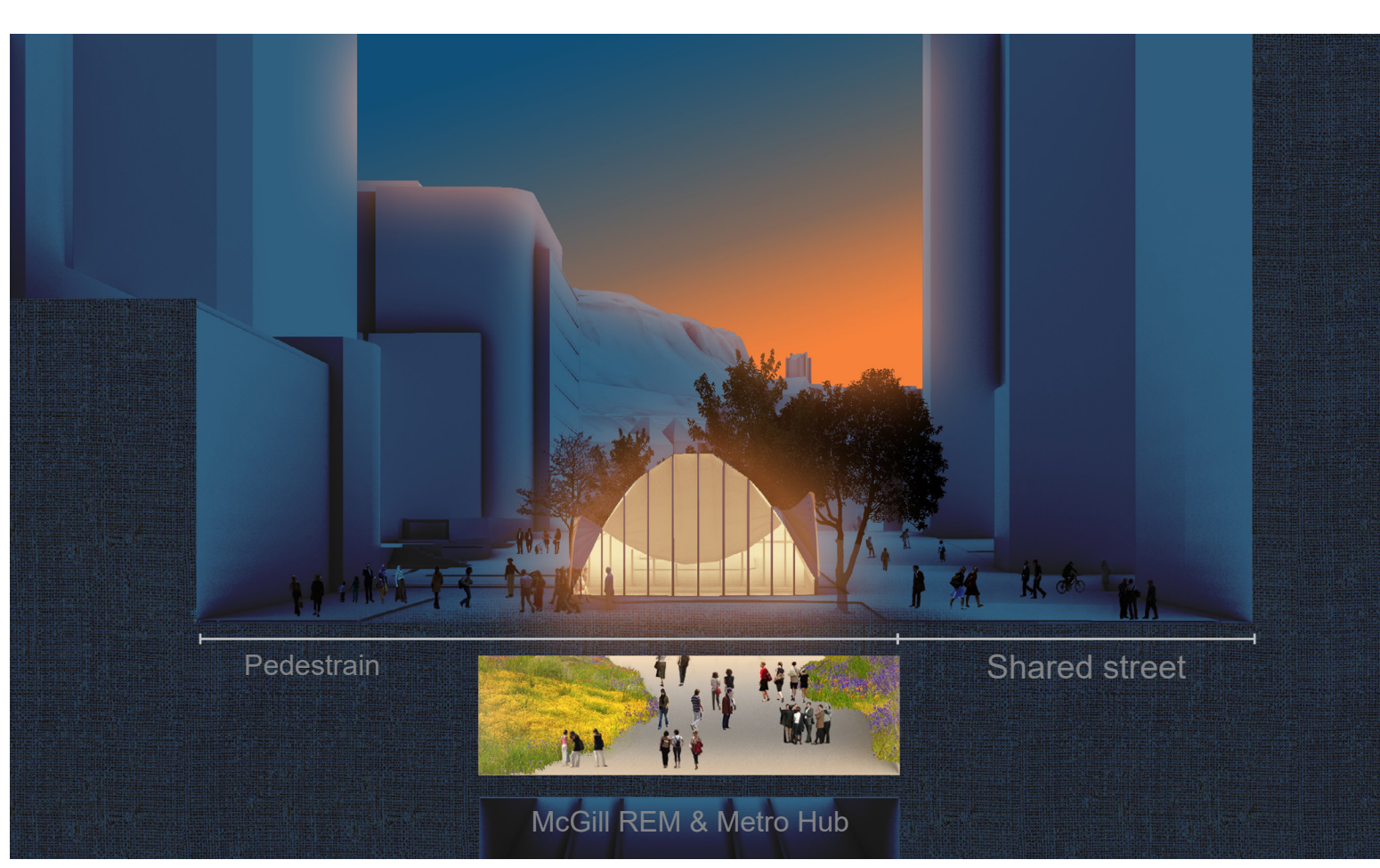
Section A - Scale 1:250