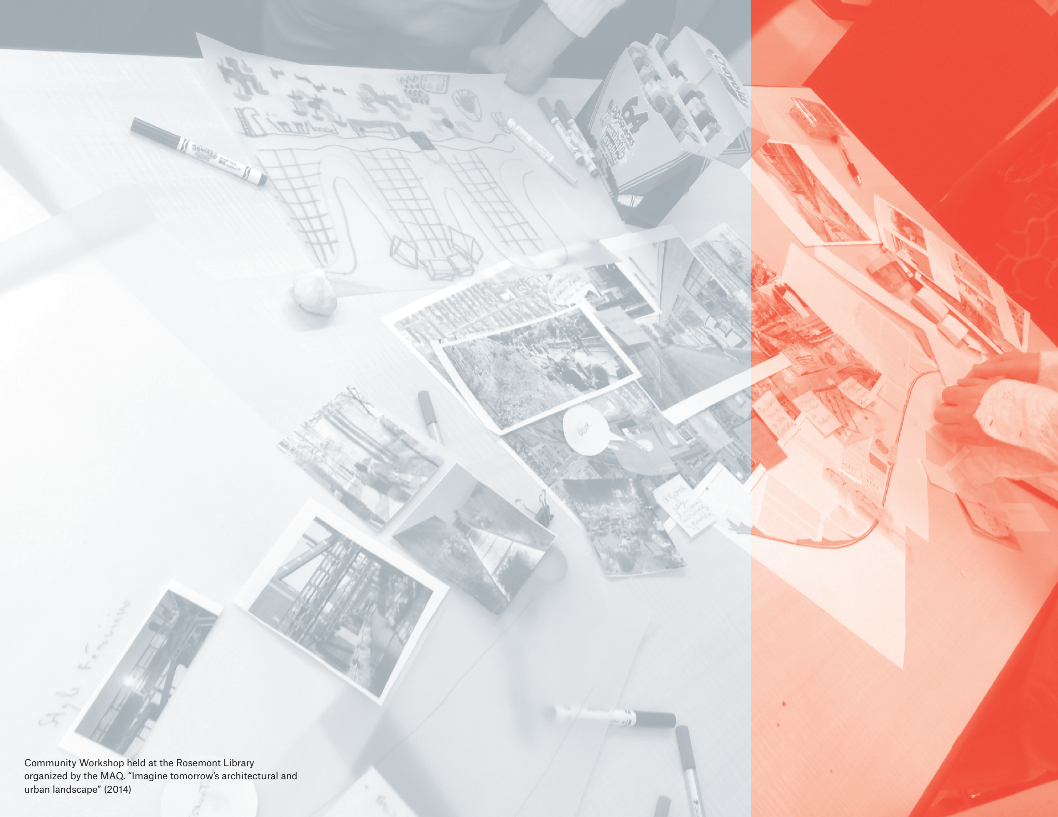
Community Workshop held at the Rosemont Library organized by the MAQ. "Imagine tomorrow's architectural and urban landscape" (2014)