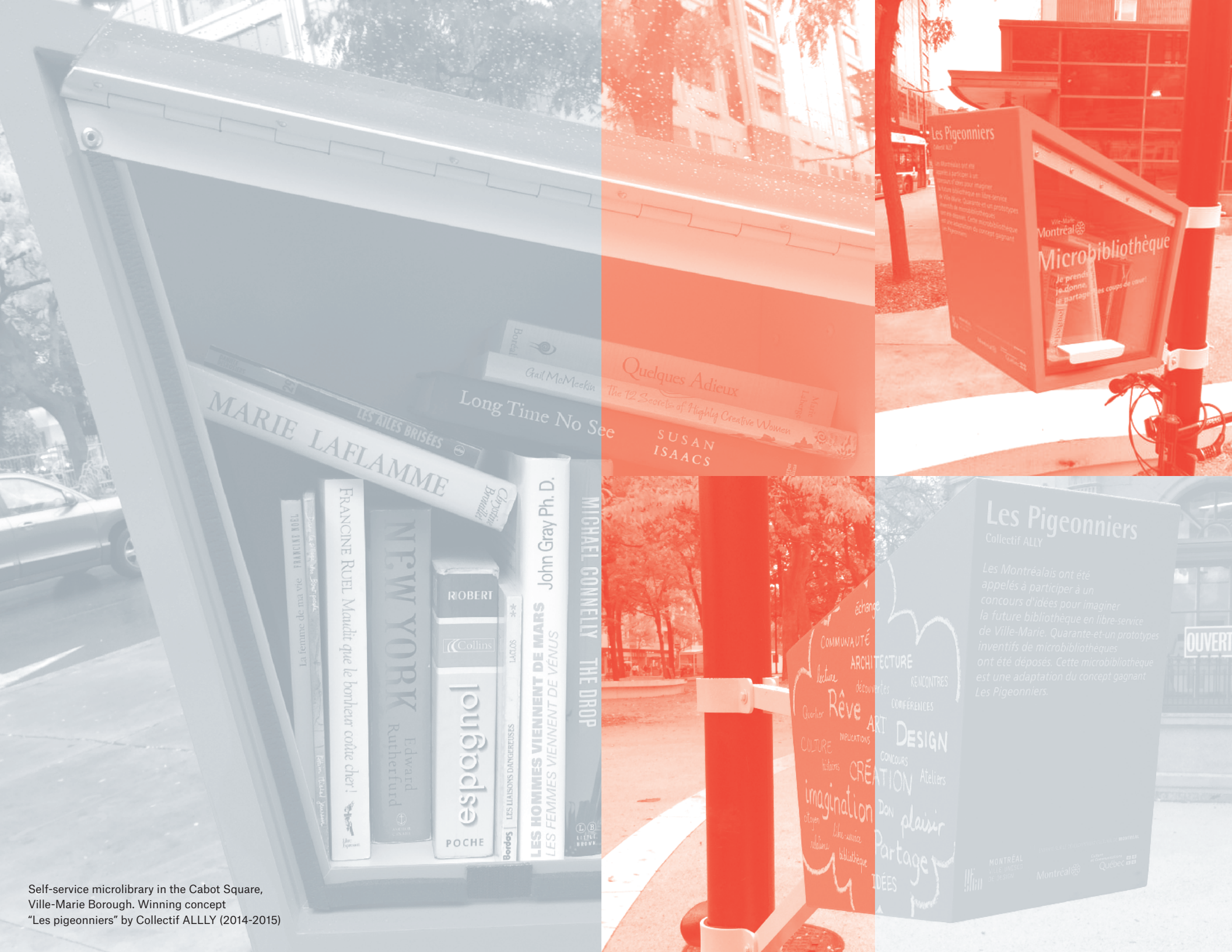
Self-service microlibrary in the Cabot Square, Ville-Marie Borough. Winning concept "Les pigeonniers" by Collectif ALLLY (2014-2015)