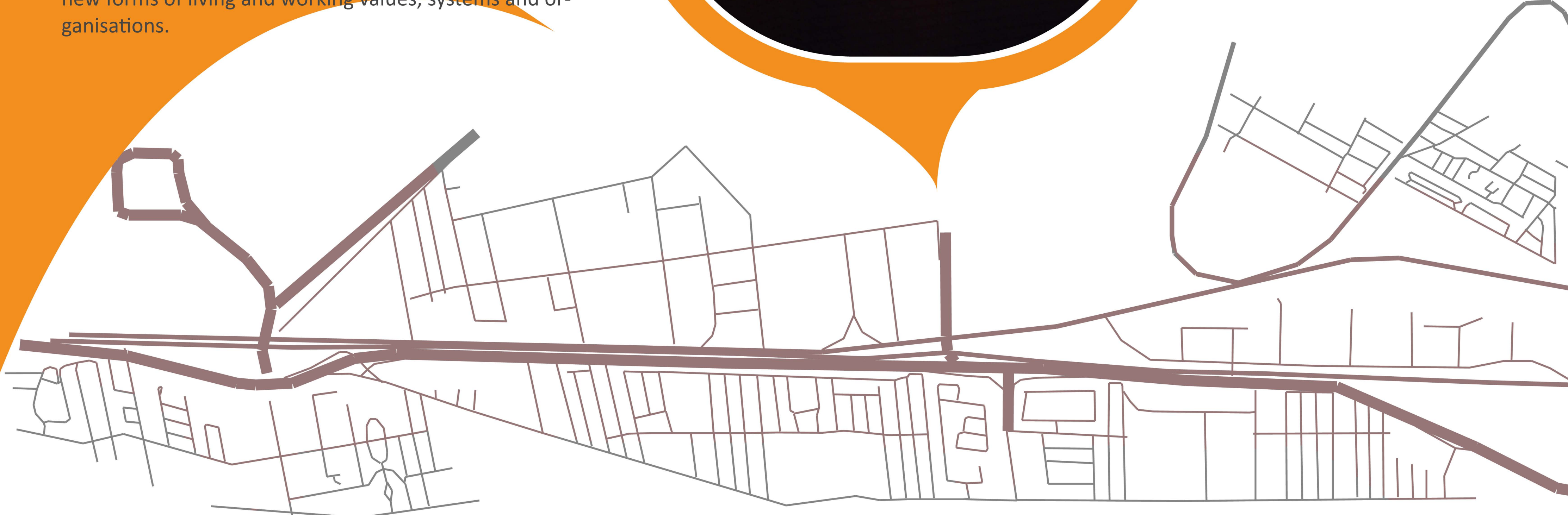
Masterplan : Transportation modes and public green spaces scale 1:60000