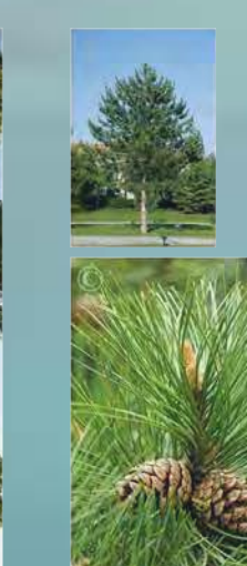
Pinus nigra austriaca Pin noir d'Autriche