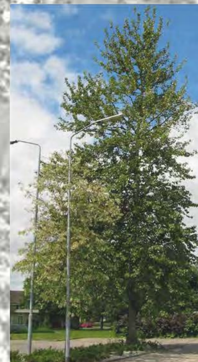
Populus balsamifera Peuplier baumier