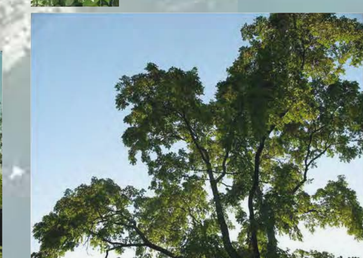
Robinia pseudoacacia Robinier faux-acacia