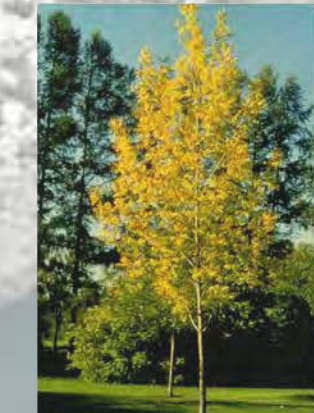
Fraxinus nigra frêne noir