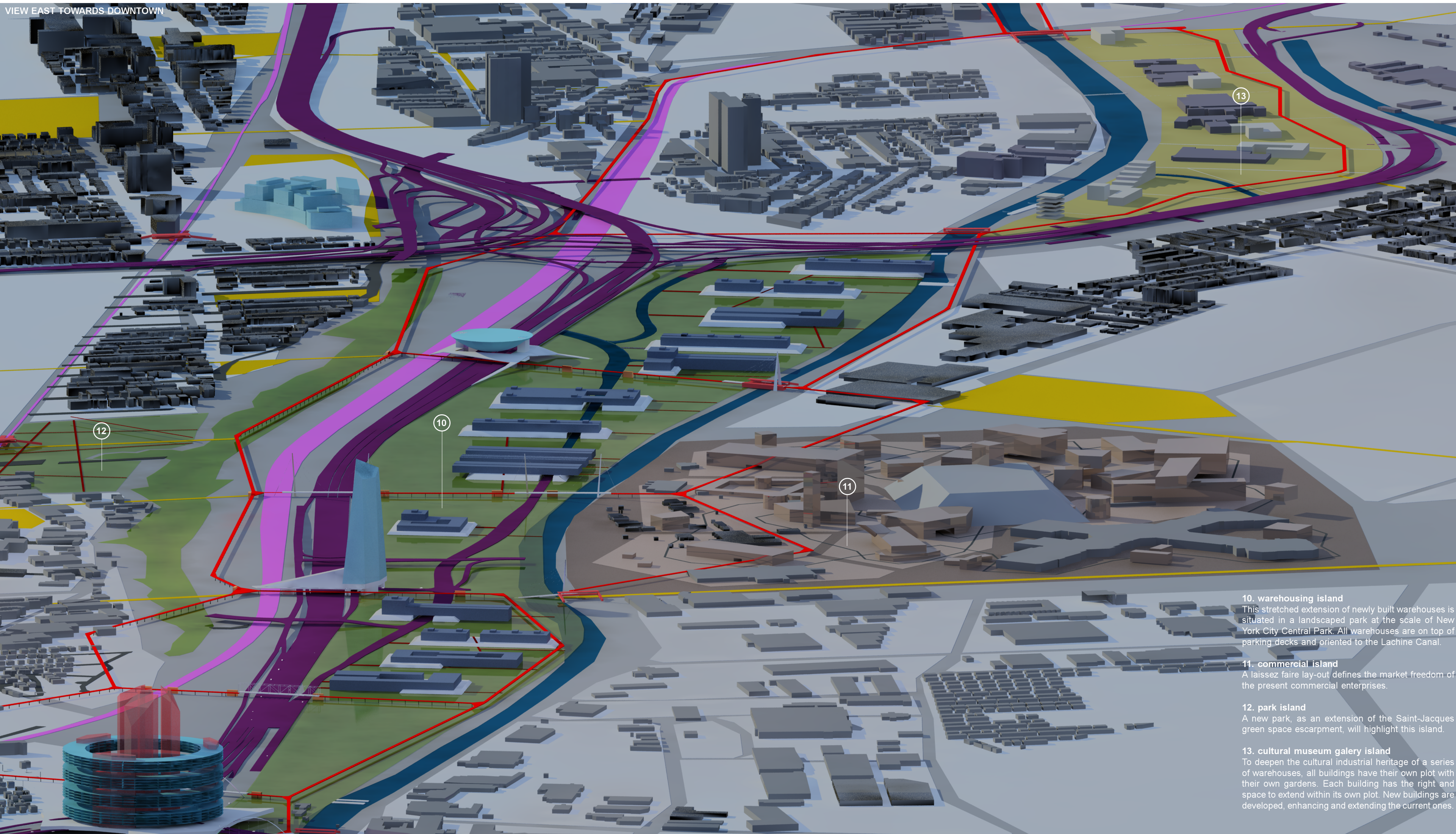
VIEW EAST TOWARDS DOWNTOWN

The network The network links the local boroughs and communities with the heavy infrastructures and the seven islands. It is made of a modular elevated linear deck at +6 m, serviced with ramps, stairs, escalators and elevators. It has integrated lighting and facilities like service stations for bicycle and electric scooter rental. Landscape and vehicles can pass below at grade.