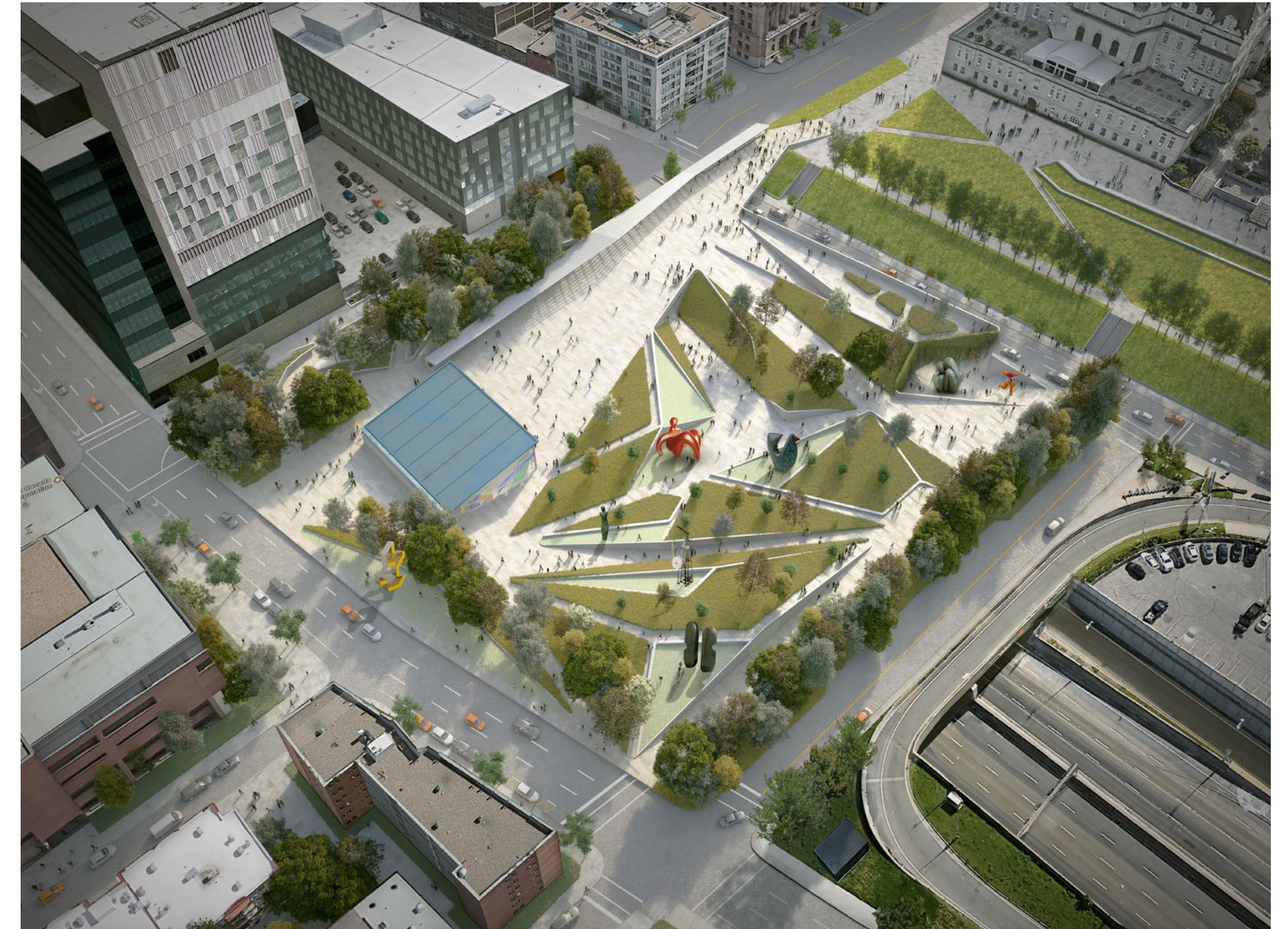
Aerial view of the site