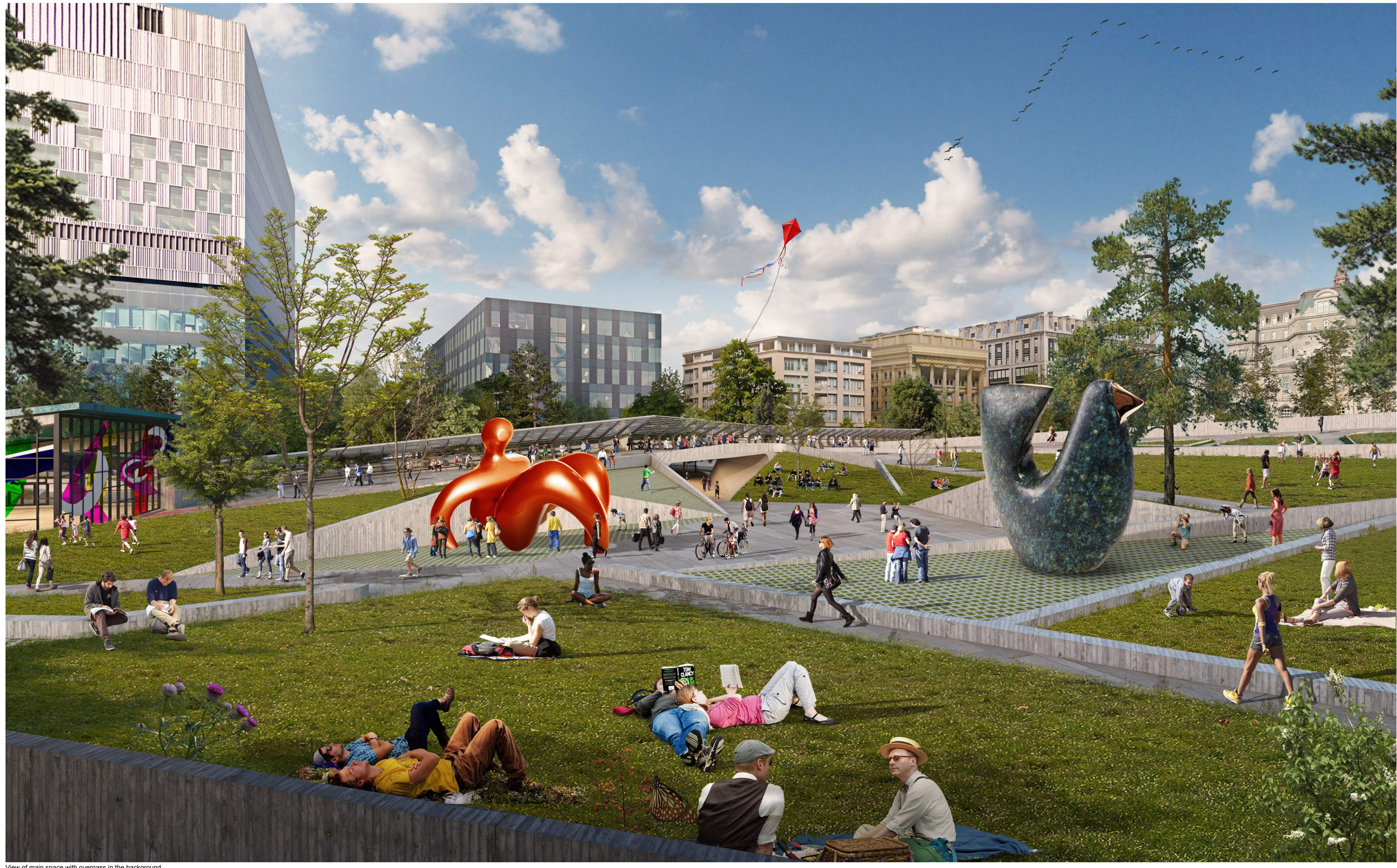
View of main space with overpass in the background