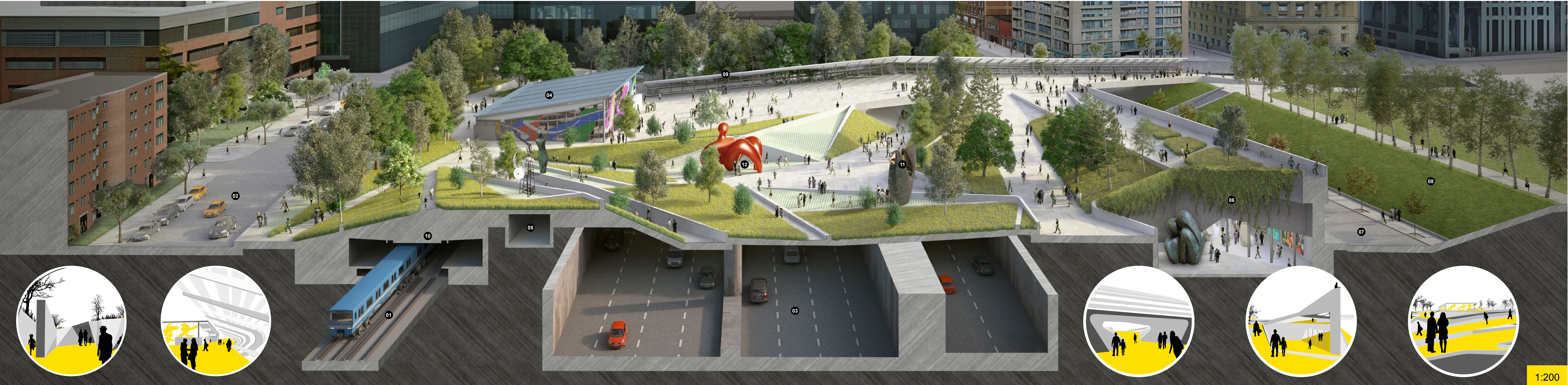
Section through the site looking North