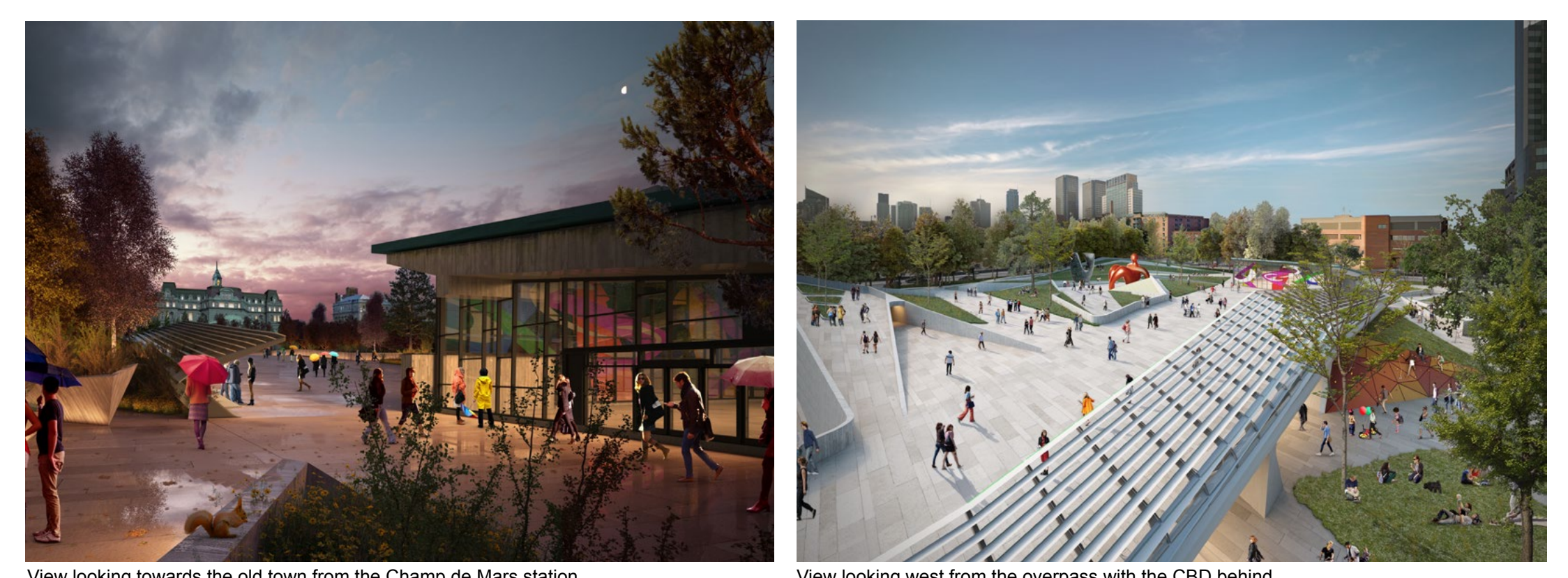
View looking towards the old town from the Champ de Mars station